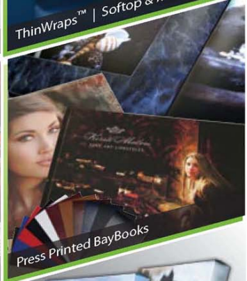
Press Printed BayBooks