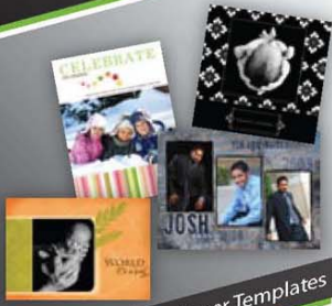
Bay Propel | Designer Templates