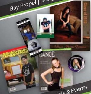
Sports, Schools & Events