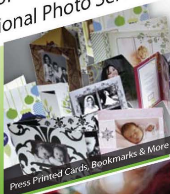
Press Printed Cards, Bookmarks & More