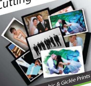
Photographic & Giclée Prints