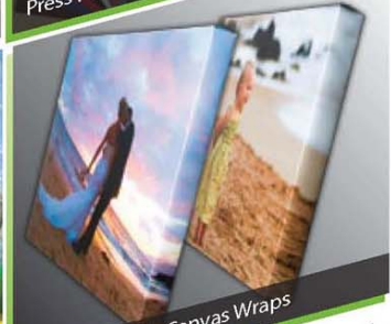
Photo & Giclée Canvas Wraps