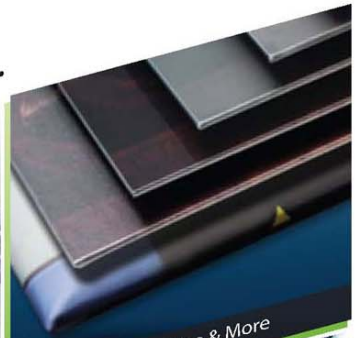
ThinWraps™ | Softtop & More